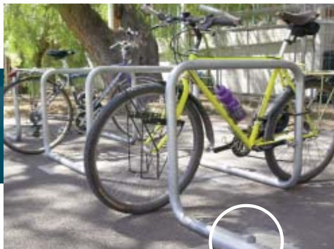
Anaconda parking rails secured to concrete plugs