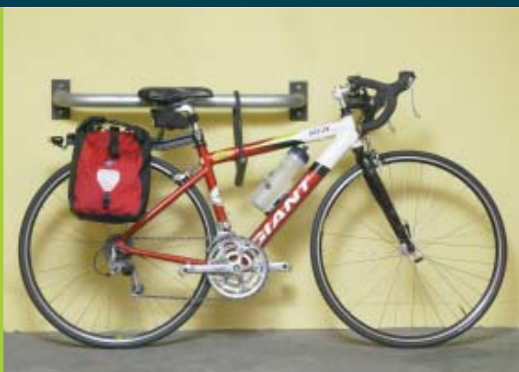
Towel Rail parking rail at Bicycle Victoria

The Towel Rail is a space-effective solution for parking single bikes against a wall.